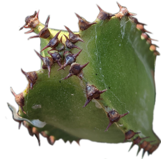
Something with 4 fold rotational symmetry