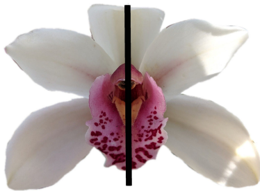
Something with mirror symmetry