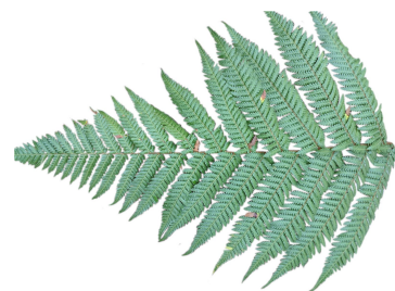
A fractal pattern